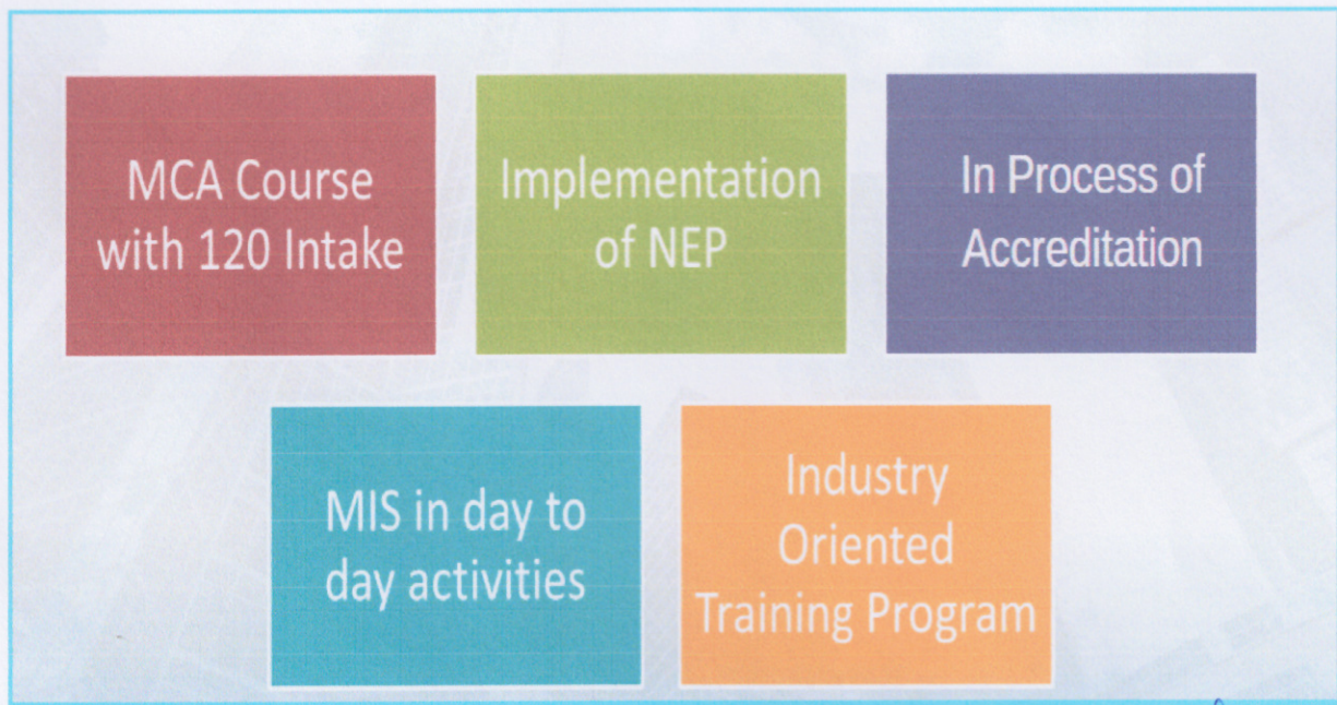
Diagram for Implementation of Strategic Plan