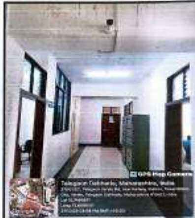
Camera in Corridor