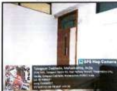
Camera at Classroom