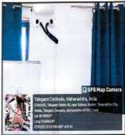
Camera at LAB