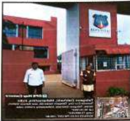
CCTV Camera at Main Gate