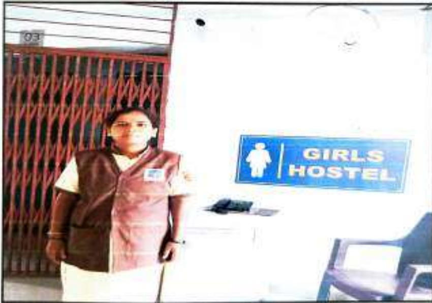
Female Warden at Hostel