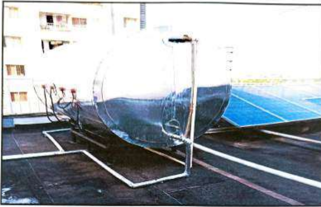
Hot Water Solar System at Hostel