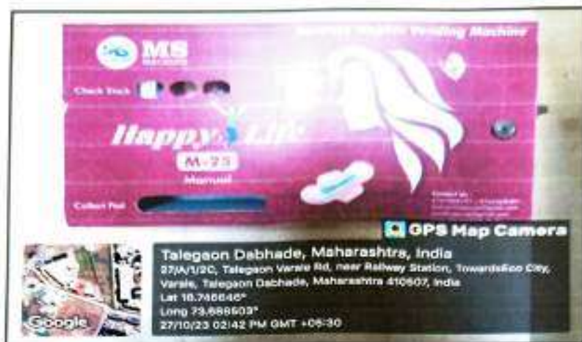
Sanitary Napkin Vending Machine