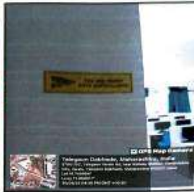
CCTV Surveillance signage