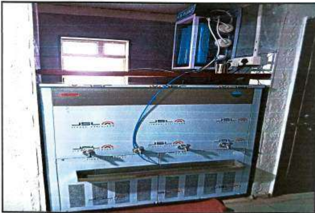
RO Water Plant at Hostel